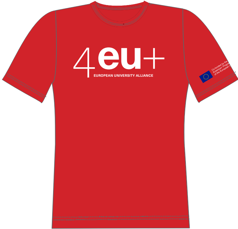
DESIGN STYLE 2