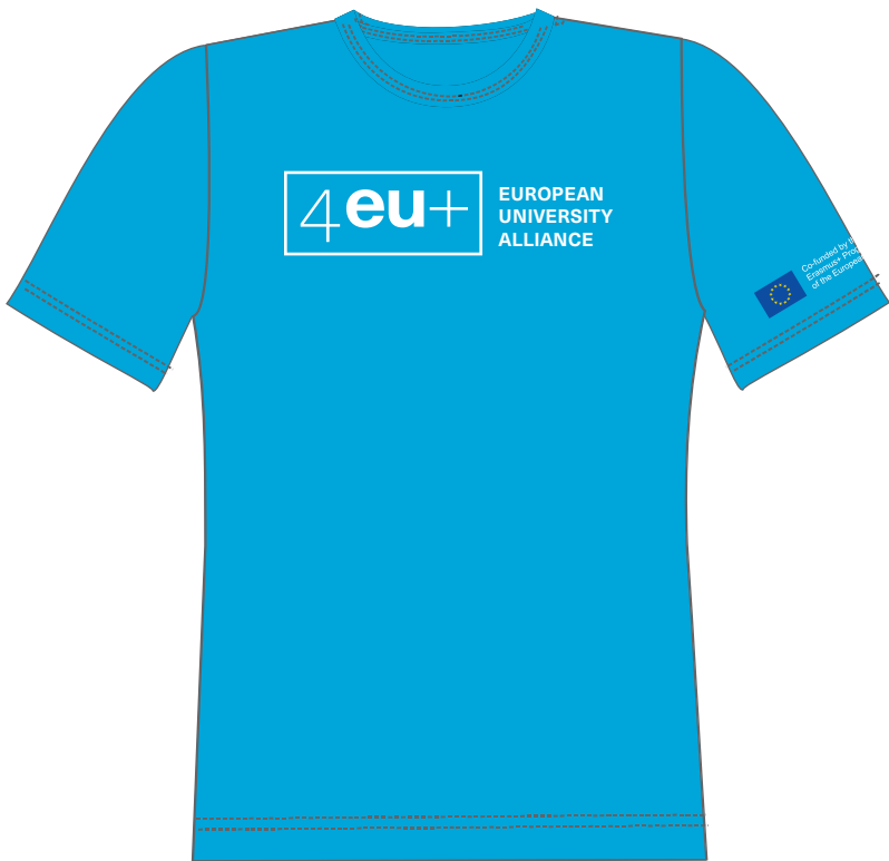
DESIGN STYLE 4