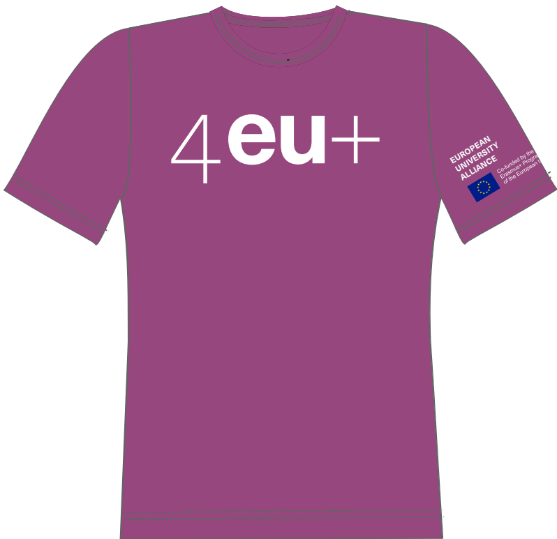
DESIGN STYLE 3