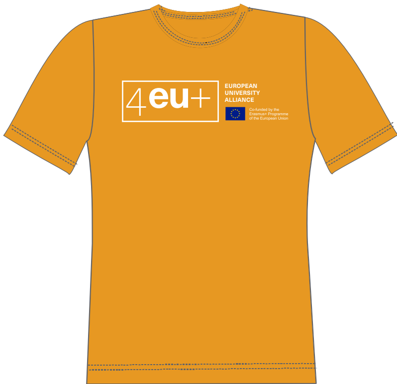
DESIGN STYLE 5