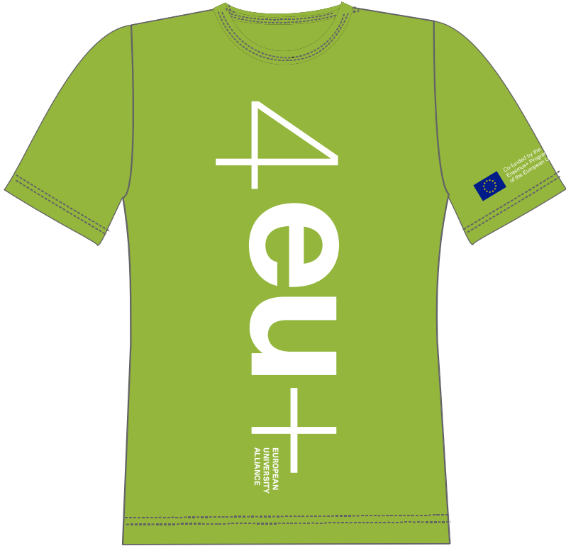
DESIGN STYLE 1